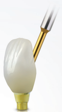
Angled Hybrid Abutment

Compatible With 16 Leading Implant Systems.