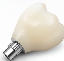
Screw-Retained FC Zirconia Hybrid