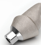
Screw-Retained SLM Hybrid